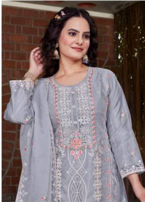
TOP:- HEAVY DULL ORGANZA WITH HEVAY EMBROIDERY AND ZARKAN BOTTAM/INNER :-HEVAY SANTTON DUPATTA:-HEAVY DULL ORGANZA WITH HEVAY EMBROIDERY