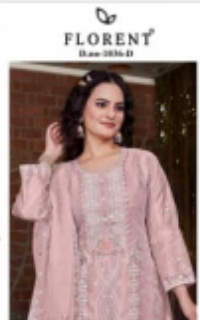
TOP:- HEAVY DULL ORGANZA WITH HEVAY EMBROIDERY AND ZARKAN BOTTAM/INNER :-HEVAY SANTTON DUPATTA:-HEAVY DULL ORGANZA WITH HEVAY EMBROIDERY