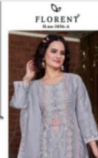
TOP:- HEAVY DULL ORGANZA WITH HEVAY EMBROIDERY AND ZARKAN BOTTAM/INNER :-HEVAY SANTTON DUPATTA:-HEAVY DULL ORGANZA WITH HEVAY EMBROIDERY