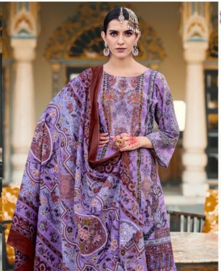
"Fashion is the most powerful of things. It's respectful, dignified, and breathtaking all in one. It shows the world who we are and who we'd like to be."