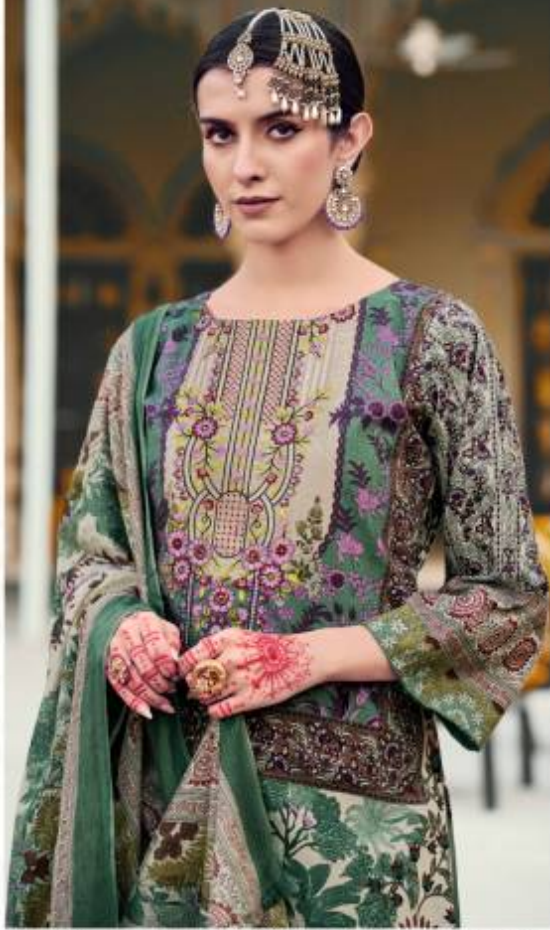
"Fashion is not necessarily about things. It's not about brands. It's about something else that comes from within you."