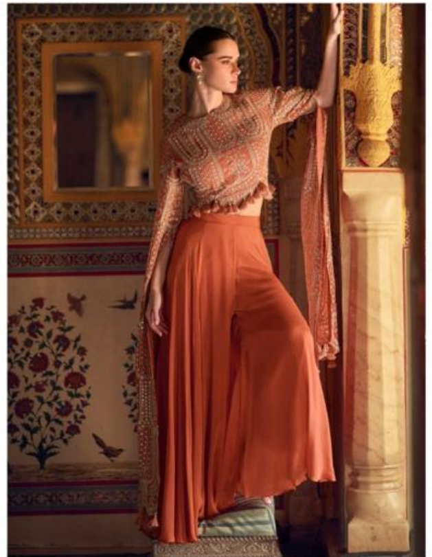
D NO : 5741