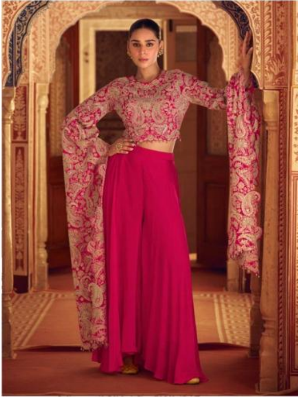
D NO : 5738