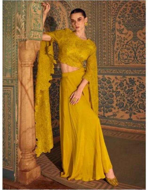
D NO : 5739