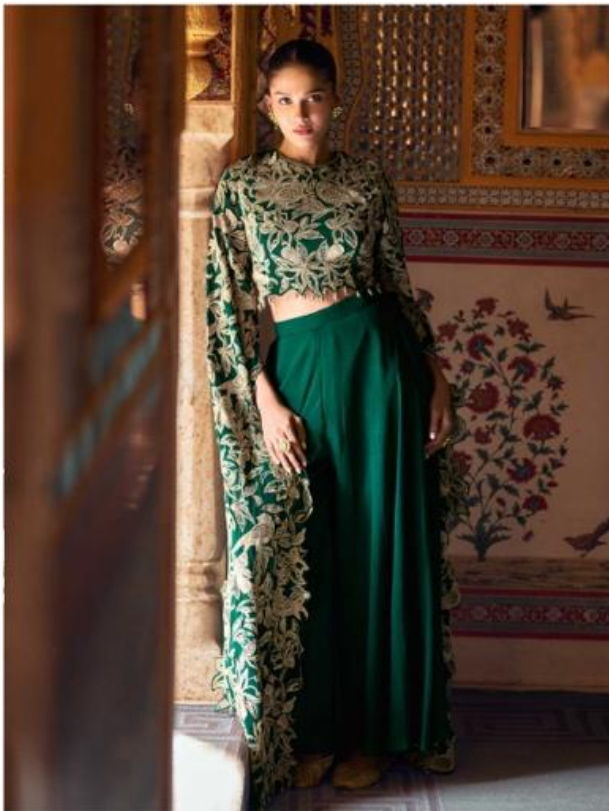
D NO : 5740