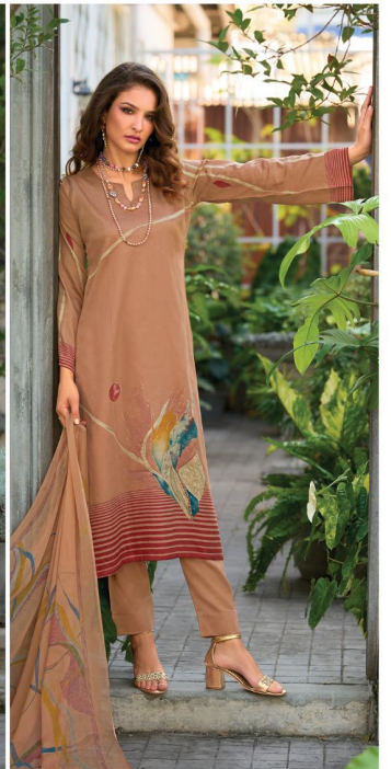
SAAZ . 1264