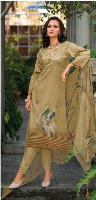
SAAZ . 1262