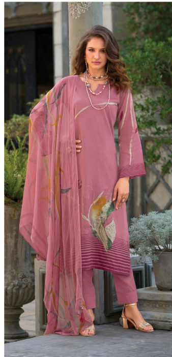
SAAZ . 1263