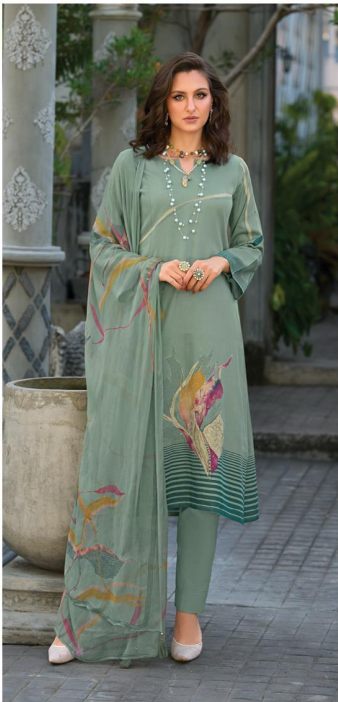
SAAZ . 1261